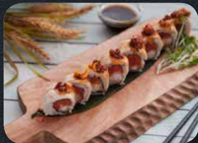
Monkey Jumps Roll