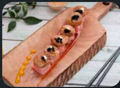
Russian Roulette Roll