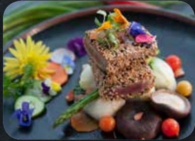
Sesame Crusted Loin of Tuna