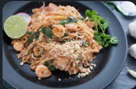
Shrimp Pad Thai