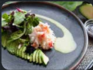
King Crab Salad