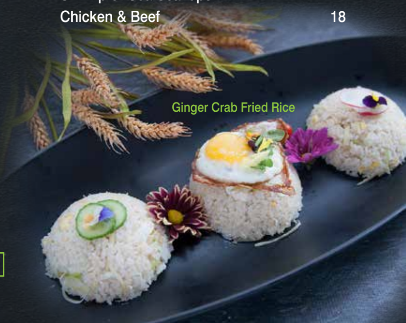
Ginger Crab Fried Rice