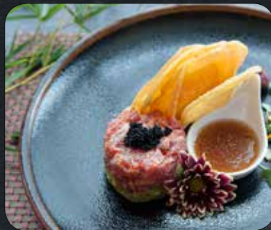
Spicy Tuna Tartar