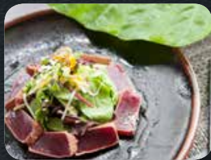
Seared Tuna Salad