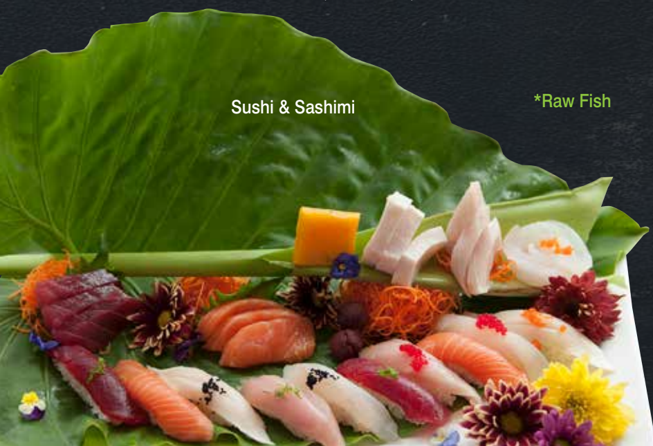
Sushi & Sashimi