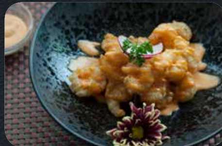
Rock Shrimp Tempura