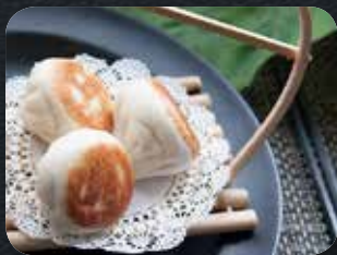
Pan Fried Pork Bun