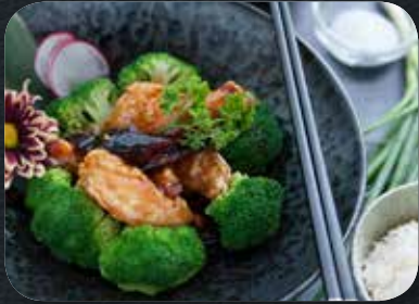
General Tso's Shrimp