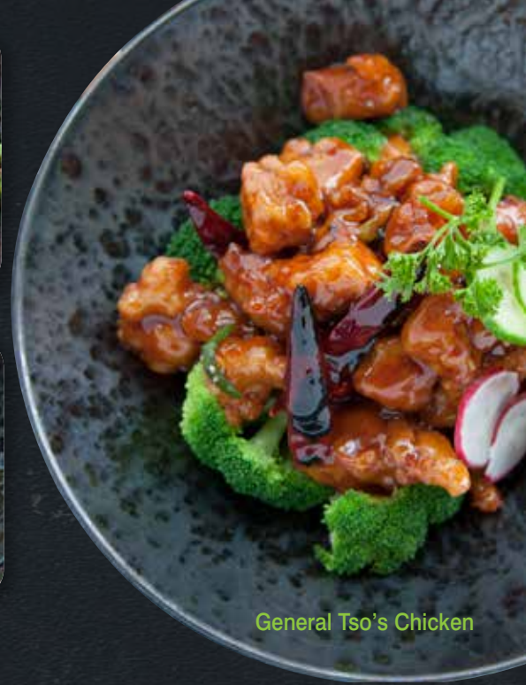
General Tso's Chicken