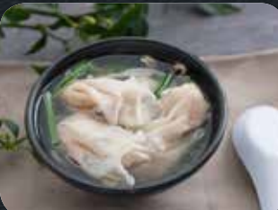
Frenasia Dumpling Soup