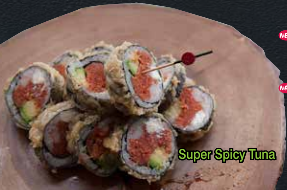
Super Spicy Tuna