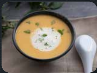
Butternut Squash Soup