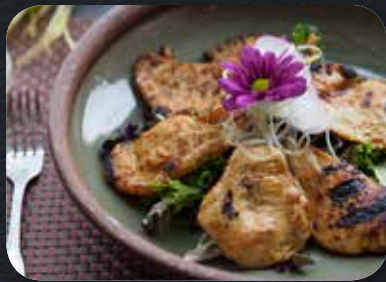
Asian Grilled Chicken