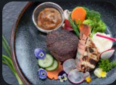
Lobster Tails & Filet Mignon