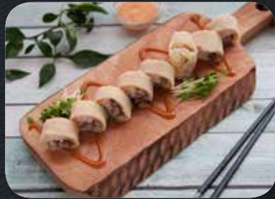
Donald Duck Roll