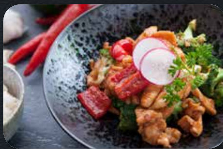
Chicken Broccoli w. Brown Sauce